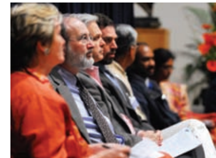
'One woman speaks of her frustration in "only" reaching 100,000 people...'

While the Australian Government provides a social safety net for its most vulnerable citizens, the bureaucratic and risk-averse nature of its support means some populations inevitably slip through the cracks. Nimble, innovative, grass-roots organisations, led by passionate social entrepreneurs who live with these challenges everyday, are often better able to fill the need gaps that government simply isn't structured to address. SVA focuses its resources on where the government falls short by building the capacity and effectiveness of these innovative non-profit ventures, enabling them to demonstrate impact and eventually to access government or other private-source funding.